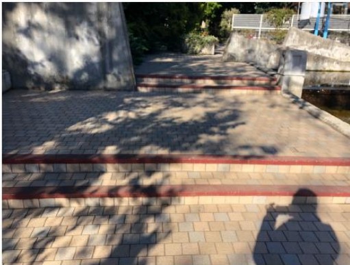
3 Go up the stairs behind the fountain