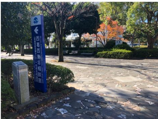
4 At the end of the stairs, turn left