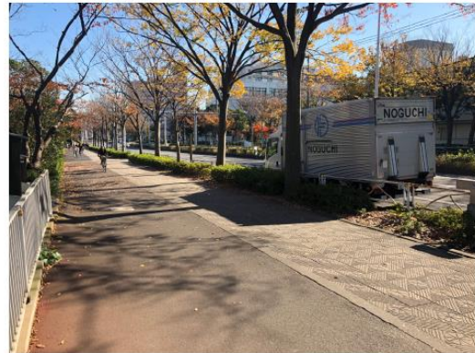
7 Turn left and go straight to the first intersection