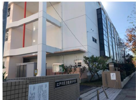
8 Cross the intersection, you find the Rinkai elementary school on your left