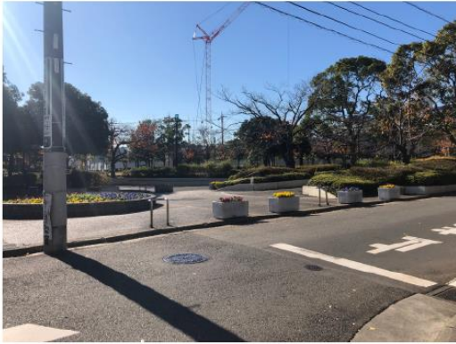
1 Pass through Shinden 6gou Park in front of the main building