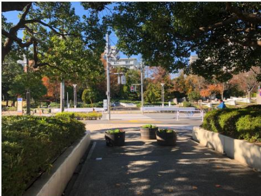
2 Head to the fountain of Shinnagashimagawa Shinsui park