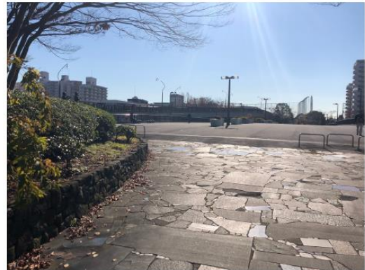
6 Cross the Shinsakon bridge and turn left