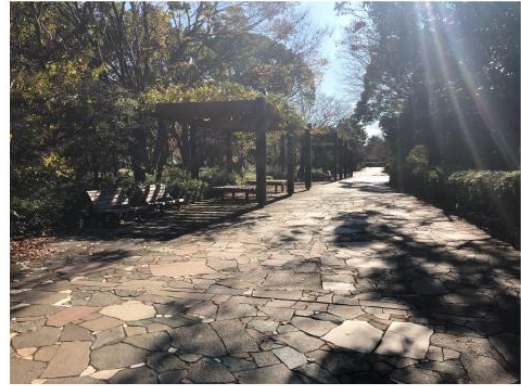
5 Go south for a while